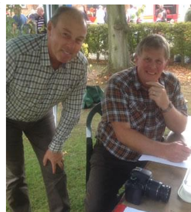
100th U3A member 'signing up' at the Village Show in September.