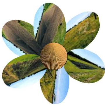
Stage 1 – Preparing the land