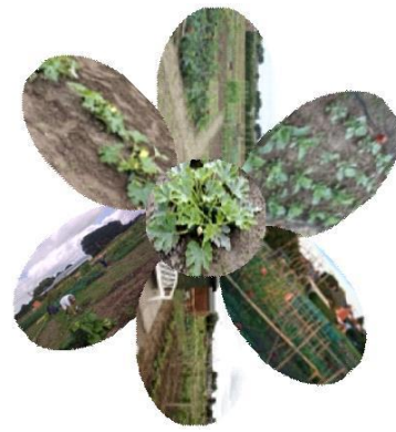
Stage 3 - The Growing is underway