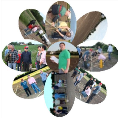
Stage 2 – Marking out the Plots