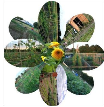
Stage 4 – What a blooming site